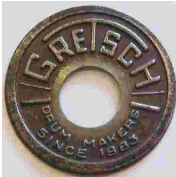
Skinny Stick/Large Font Badge (author)

Pictures of Skinny Stick/Large Font Badge: