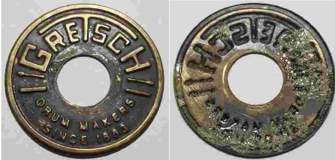
Apparent Counterfeit Badge - Note inconsistent angles of sticks. (Bill Maley)