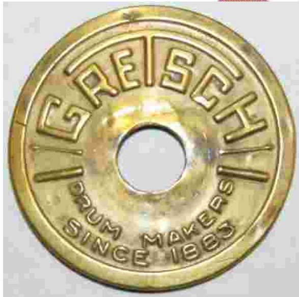
"ROBBINS CO. ATTLEBORO" on obverse, textured finish. Date Unknown (author)

Pictures of Robbins Co. Textured Skinny Stick Badge