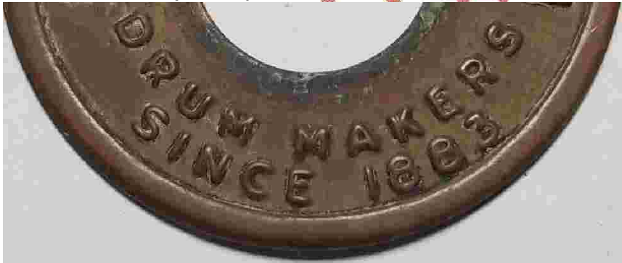
Detail of Thick Stick/Medium Font Badge (Bill Maley)