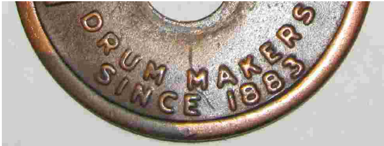
Detail of Thick Stick Copper Badge (author)