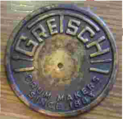
Single Tone Brass with patina (area under tack is light)