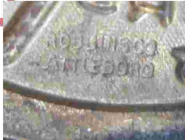
Detail of "ROBBINS CO ATTLEBORO" mark. Date Unknown (author)