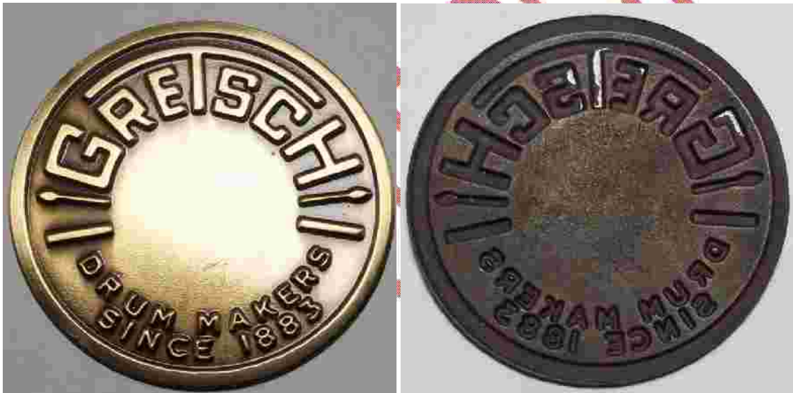
Apparent Reproduction Badge (Bill Maley)