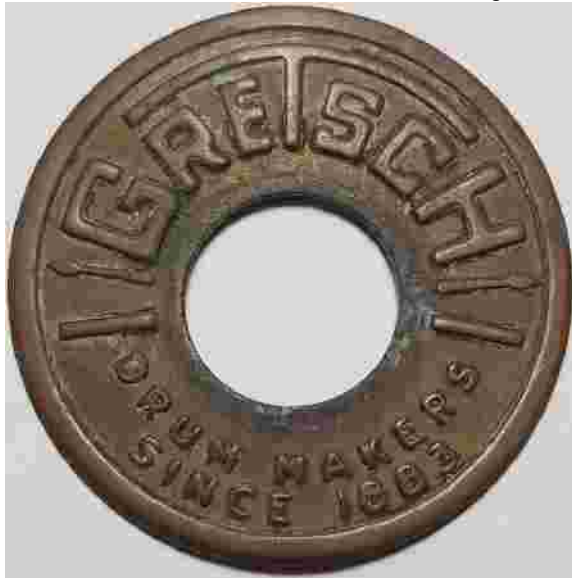
Thick Stick/Medium Font Badge (Bill Maley)

Pictures of Thick Stick/Medium Font Badge: