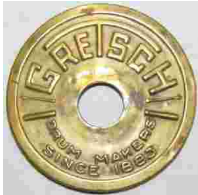
Appears to have been cleaned (lacks patina and shading)