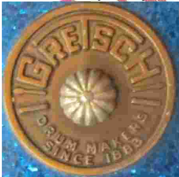
Thick Stick/Large Font Badge (author)

Pictures of Thick Stick/Large Font Badge: