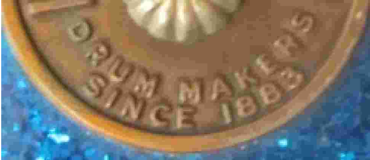
Detail of Thick Stick/Large Font Badge (author)