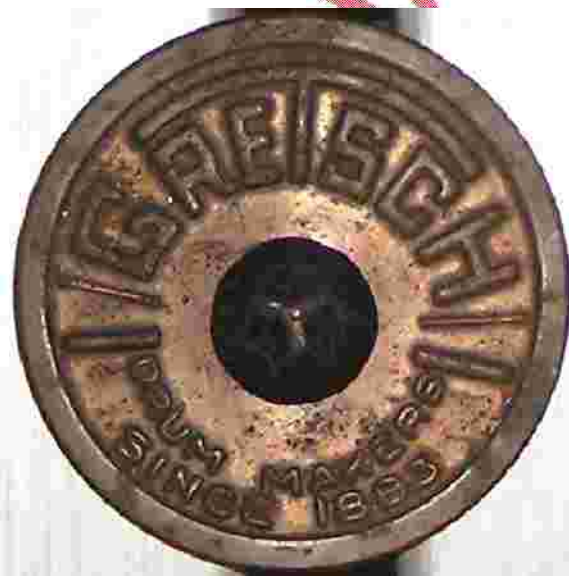
Skinny Stick/Large Font Badge (Bill Maley)