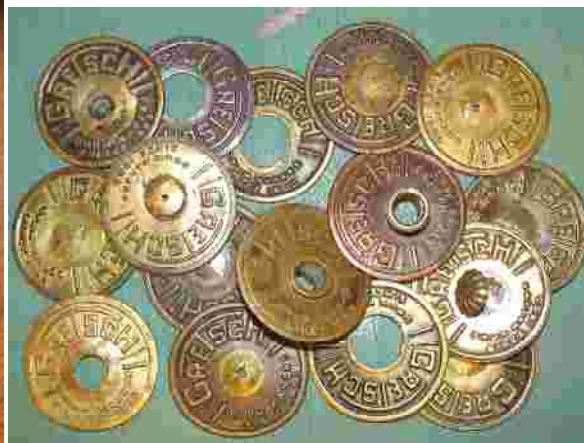
Author's more modest badge stash (author)