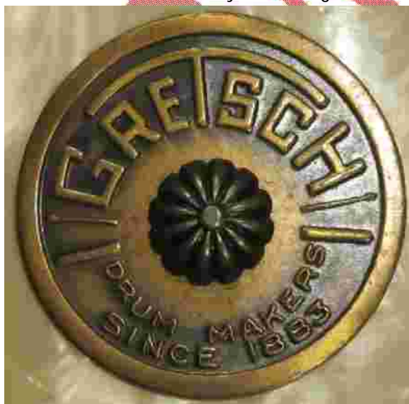
9x13 Tom, JUN 19 1952 (author)

Pictures of Textured Skinny Stick Badge: