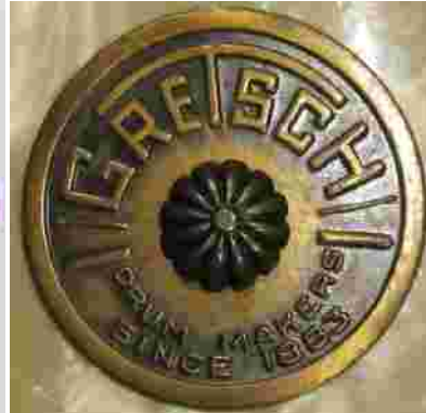
Two-Toned with wear