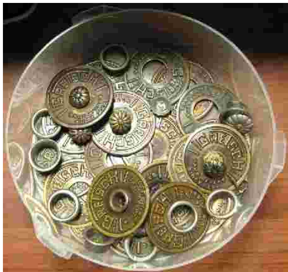
Badges salvaged from damaged drums (Bill Maley)

appears on a drum advertised as “all original,” one should be skeptical. When one is seeking to replace a lost badge, it is important to match the correct variation of badge with other original drums in a set and the production time frame. Unfortunately, better understanding of the differences in badges can also be used to make better fakes.