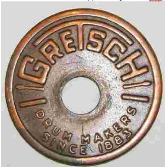
Thick Stick/Copper Badge (author)